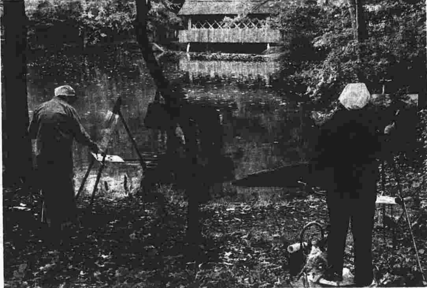
Two women take advantage of a fine fall day to do some painting under the Oakgrove bridge.