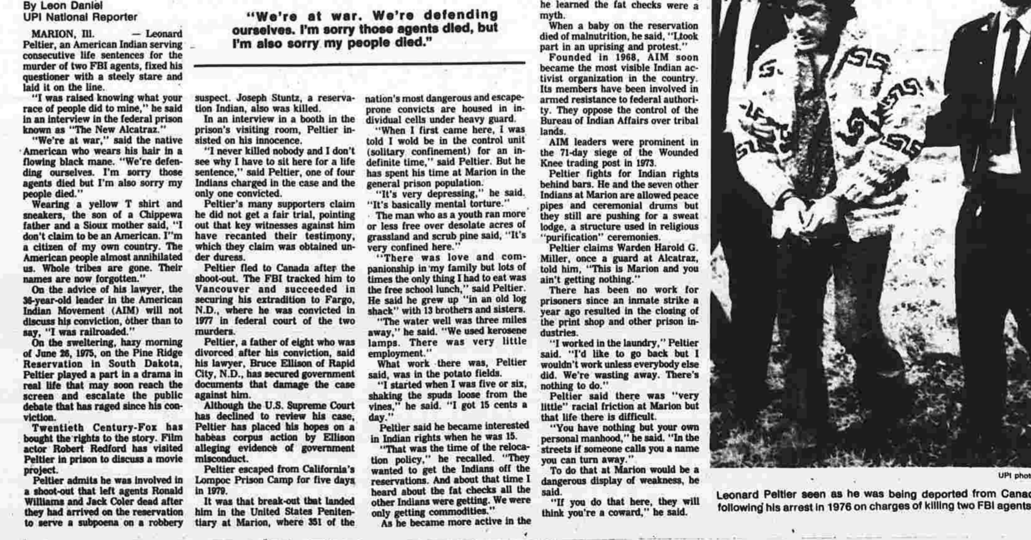
Leonard Peltier seen as he was being deported from Canada following his arrest in 1976 on charges of killing two FBI agents.

Redford may make film about convicted killer Peltier