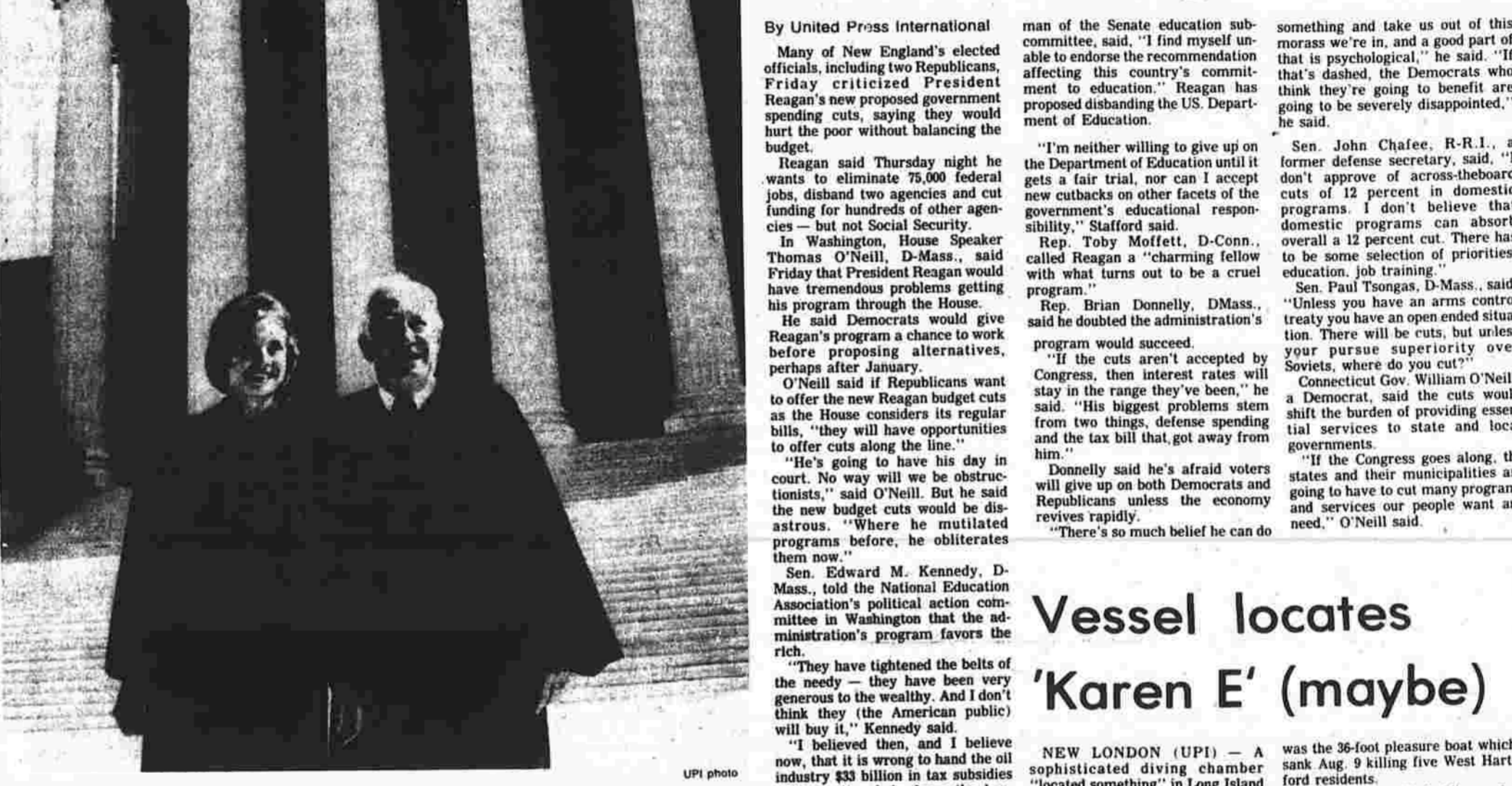
New Supreme Court Justice Sandra O'Connor stands beside Chief Justice Warren Burger, before the Supreme Court building in Washington, D.C. She was sworn in Friday.

Cloudy today; sunny breezy Sunday - See page 2... Region's leaders assail Reagan cuts