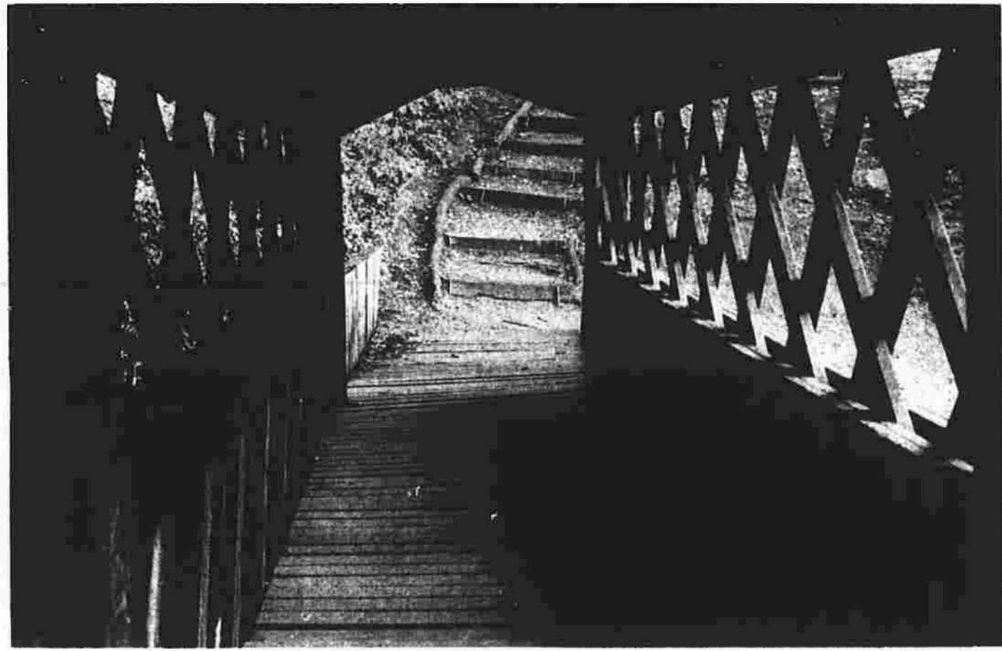
THE COVERED BRIDGE IN OAK GROVE NATURE CENTER.

Some Members of Congress and the Reagan administration have announced their intentions to revise and weaken the Freedom of Information Act.