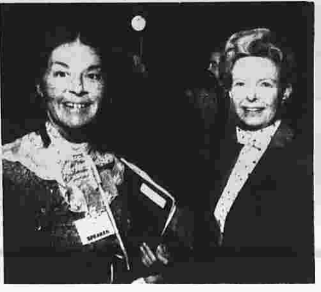
Karen DeCrow, left, former president of the National Organization of Women and Phyllis Schlafly, Moral Majority advocate, arrive at the Hartford Civic Center Friday for their debate on the Equal Rights Amendment during a two-day conference at the Civic Center.

Sylvia Porter tells how to get "Your Money's Worth" — daily on the business page in The Manchester Herald.