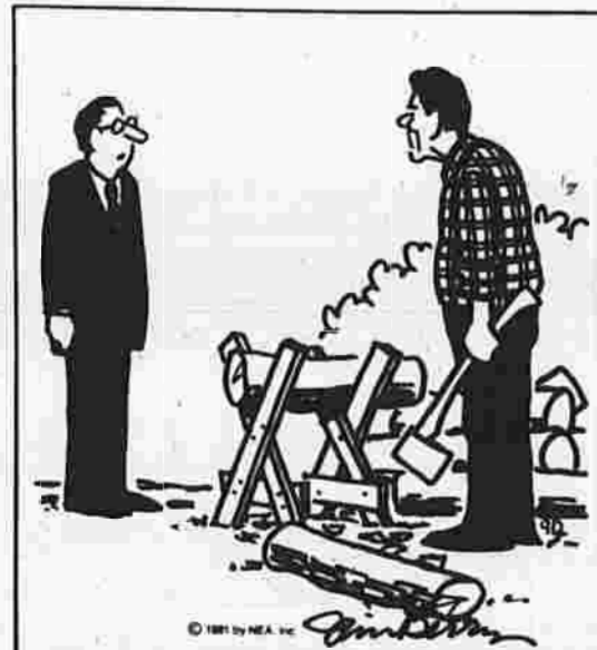
"The delegation from the WCA - 'Woodchoppers Anonymous' - is here to see you, Mr. President."