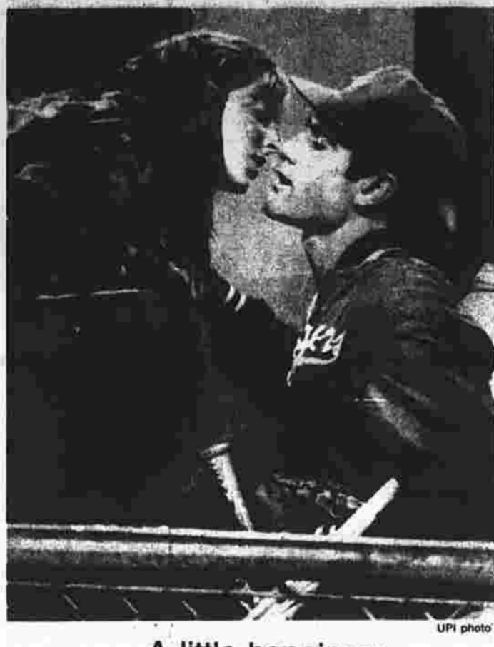
A little happiness

TORONTO (UPI) — The Chicago Sting, who have twice beaten the powerful New York Cosmos, are expected to simply bring themselves, expect sound offense rather than superbman effort will be enough to bring them their first North American Soccer League championship Saturday night.